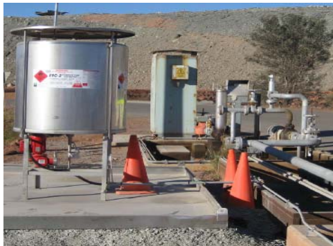
Figure 1 FTC/FPC Diesel catalyst dosing system

1269, 1326 and 1581. A calibrated catalyst-metering system was installed, allowing diesel fuel to be FTC/FPC treated at time of fuel transfer from bulk storage tanks to day tanks at refuelling bay, as shown in Figure 1 below.